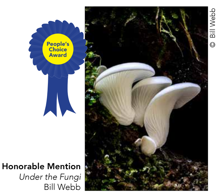
The Shutterbug | September 2020 | 8