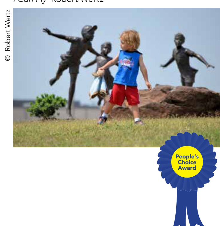
The Shutterbug | September 2020 | 7