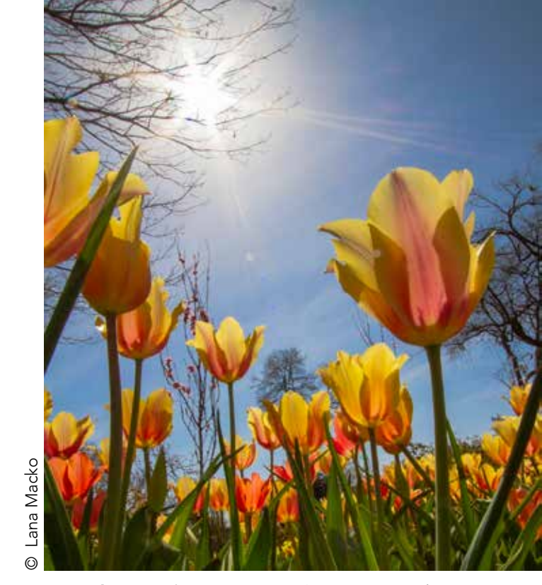
2nd Place Tulips Down Under Lana Macko