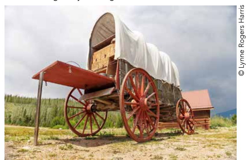
3rd Place Covered Wagon Lynne Rogers Harris