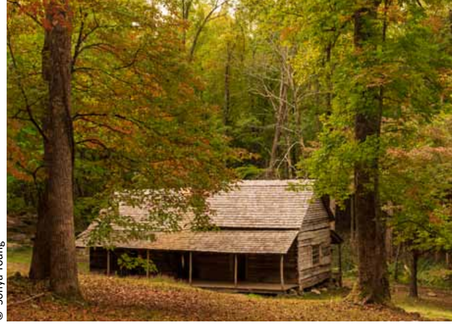
Cabin in the Woods