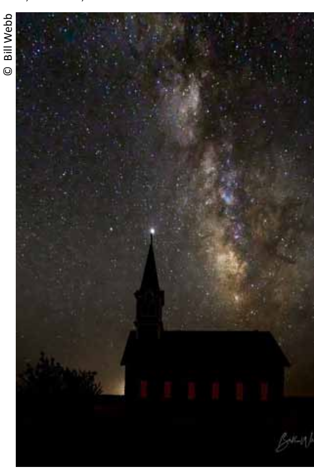
Old Rock Kirke with Milky Way and Saturn 15 sec.; f/4; ISO 3200; 14mm