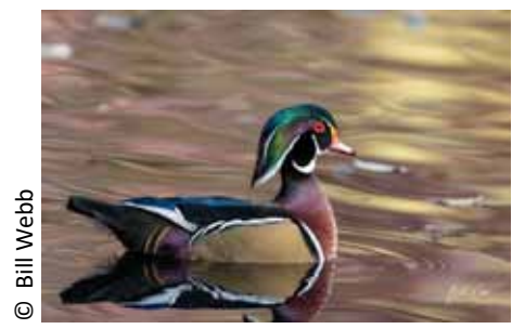
Wood Duck male 1/500 sec.; f/8.0; ISO 1000; 600mm