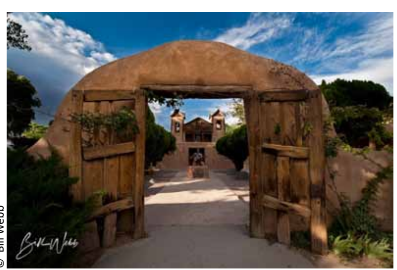
Santuario Chimayo on the high road to Taos 1/125 sec.; f/11; ISO 200; 14mm