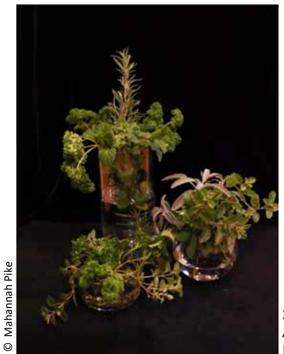
3rd Place A Simple Flower Mahannah Pike