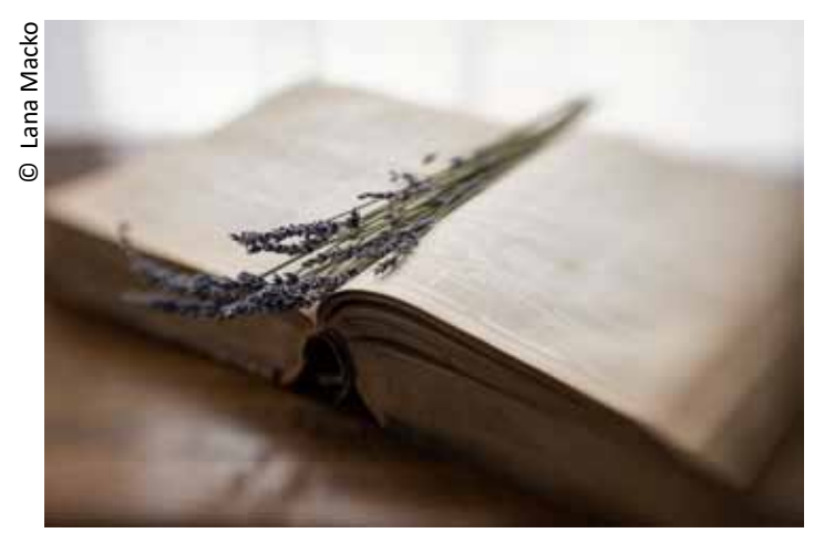
2nd Place lavender Lana Macko