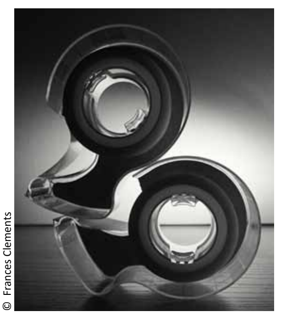
2nd Place Tape Dispensers Frances Clements