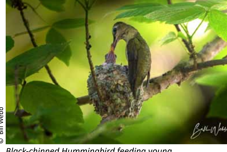
Black-chinned Hummingbird feeding young 1/320 sec.; f/8.0; ISO 2000; 600mm

is a love of mine and that fits well with a love of travel. Since early 2019 I have been into bird photography with all of its challenges and learning about the birds themselves. When not out photographing birds or landscapes I enjoy night sky photography and am working to improve that part of my skill set.