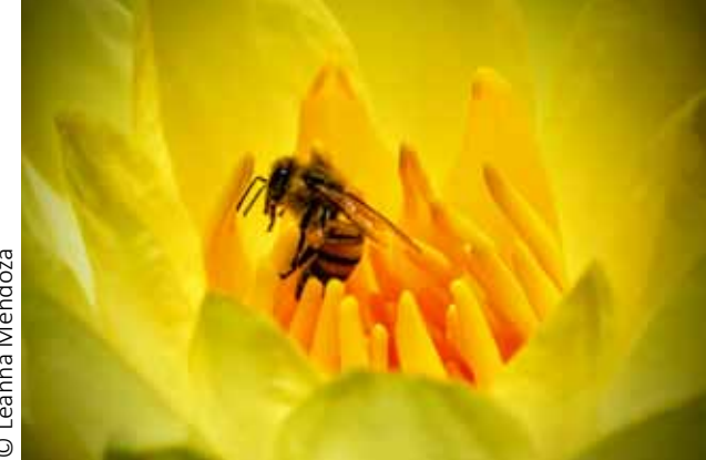
3rd Place Immersed Leanna Mendoza