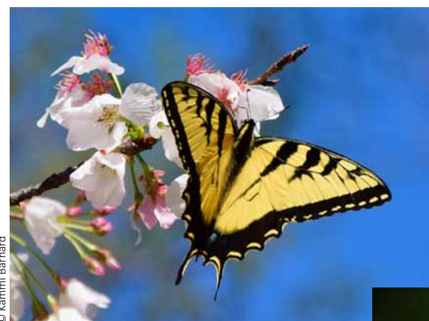
1st Place Spring Beauty Kammi Barnard

"On a lovely day, I was visiting the Ft. Worth Botanic Gardens, which is one of my most favorite places in the city. Two butterflies were fluttering about a tree at the same time, so I was very fortunate to get several photos of them which included different composition options. This photo was one of two images that I particularly liked, primarily based on the simplicity of the background, the position of the butterfly, and the colors which I thought worked nicely together. The photo is cropped. Plus, I find cropping a photo can sometimes clean up a photograph and help the subject stand out." (Nikon D5300, 200 mm, 1/1250sec., f11, ISO 640)