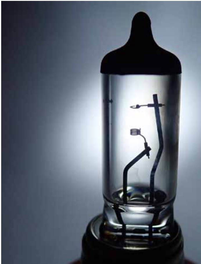
1st Place Burned Out Headlight Frances Clements

“I took this picture after replacing my burned out headlight. I think I used a flashlight for the back light.”