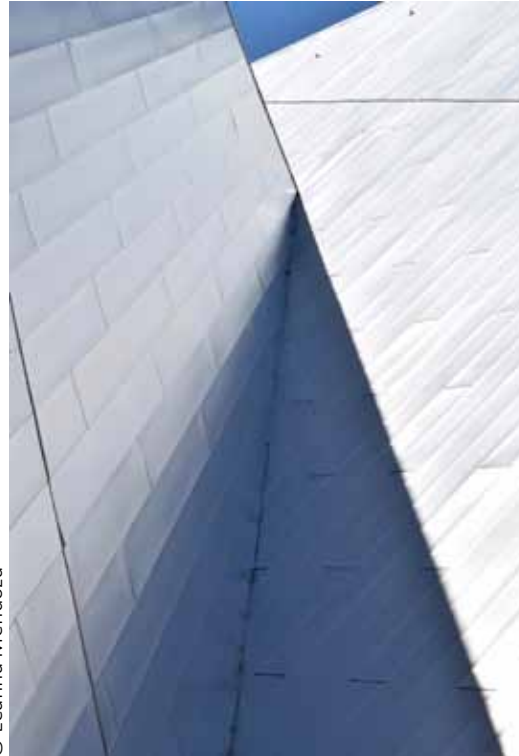
2nd Place Geometric Leanna Mendoza