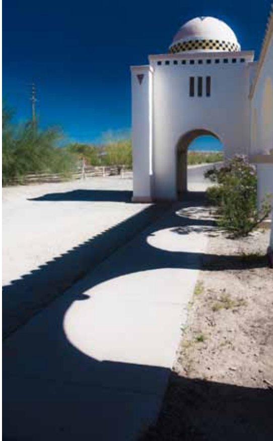
1st Place Ajo Arizona Train Station James Austin

"A section of the Ajo, Arizona Train Station (Depot) in the afternoon. Part of the building is now a visitors bureau. A very clean and interesting building near the town square." (1/200, f/11, ISO 400, Nikon D750, 24mm)