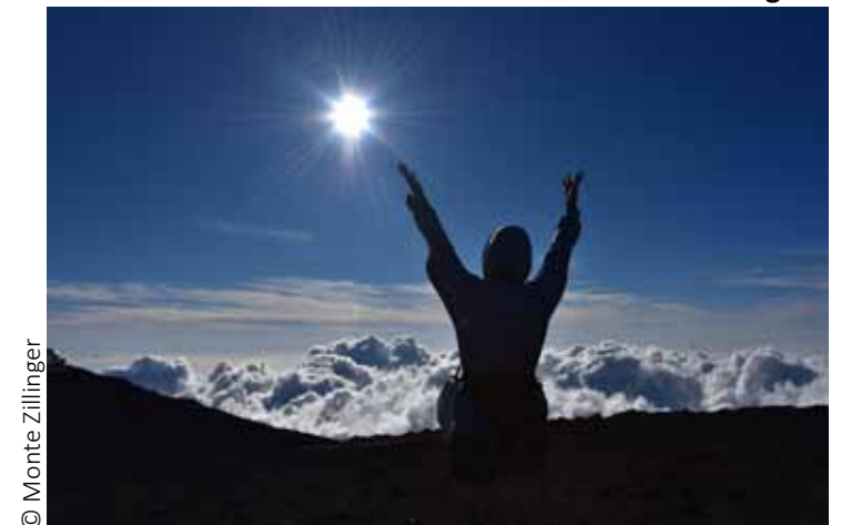
4th Place Hawaiian Mountain Sunset Monte Zillinger